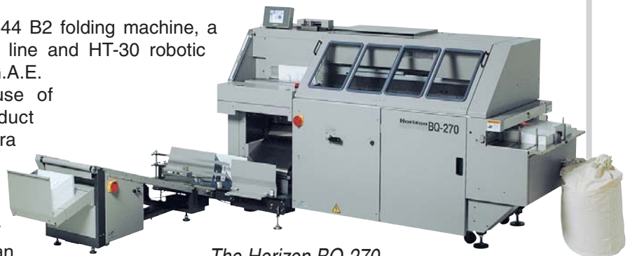
The Horizon BQ-270 automated single-clamp binder

The new Horizon systems, an AFC-544 B2 folding machine, a BQ-270 single-clamp perfect binding line and HT-30 robotic three side trimmer were supplied by G.A.E. Darren Goodson continues: "Because of their run-length flexibility and product versatility the new systems provide extra capacity which helps us cope with our increasing workload. We are using the AFC folder alongside a comparable machine from another manufacturer, but it offers more than double the throughput because of its modern features and superior feeding